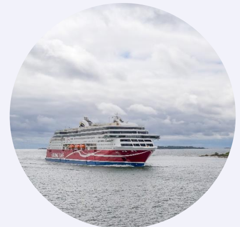
Resilient transport system