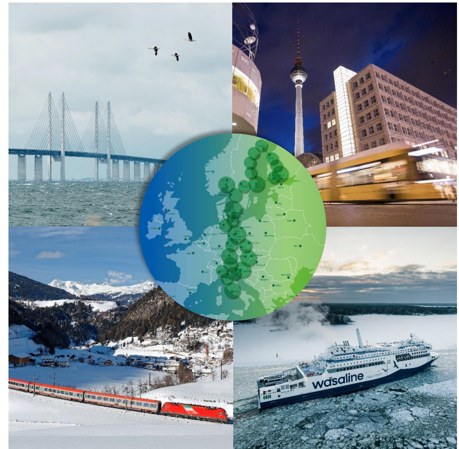
Map: Scandria Alliance / Joint Spatial Planning Department Berlin-Brandenburg