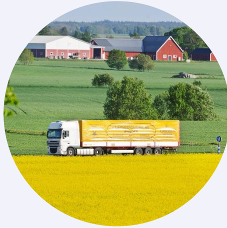
Clean fuel deployment