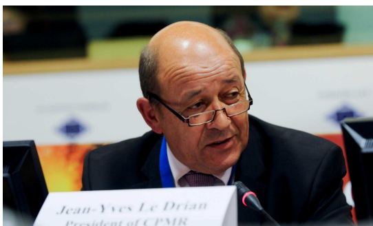
President Le Drian speaks at the EP Committee on Regional Development (REGI) where representatives of the EU major regional organisations were invited for an exchange of views with MEPs on the post-2013 EU Cohesion Policy 8 May 2012, European Parliament

Based on technical expertise and evidence from CPMR Regions, amendments on the Cohesion Policy legislative proposals were developed. A roundtable meeting was organised on 26 April 2012 to allow representatives from structural funds managing authorities (Catalonia, Basque Country, Aquitaine and BMW Regional Assembly) to present and debate these proposals for amendments with negotiators from the Member States Permanent Representations, using concrete examples from the current period. These amendments were also circulated to the European Parliament. With Ms Danuta Hübner, MEP and Chair of the European Parliament Regional Development Committee, the CPMR organised an extraordinary Regional Development Committee session in the European Parliament on 8 May, with CPMR President Jean-Yves Le Drian delivering key messages – on conditionalities, simplification and ERDF priorities for richer Regions – in front of Members of European Parliament.