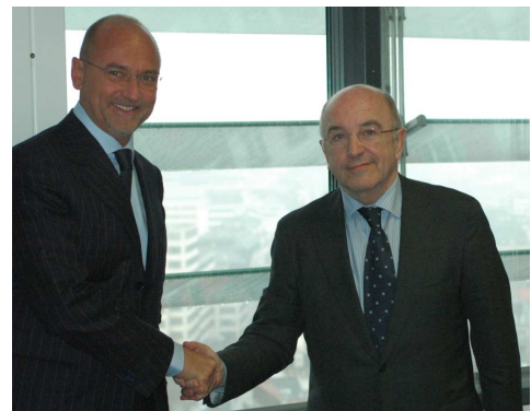
Ugo Cappellacci, President of Sardinia Region and the CPMR Islands Commission meets with Competition Commissioner Joaquín Almunia - 17 February 2012, European Commission

Now, as guidelines are being drawn up on state aid for regional assistance, the CPMR has brought the need for recognition of the specific interests of specific territories to the fore. On 17 February 2012, a meeting was held in Brussels by the Commissioner for Competition, Mr Joaquin Almunia, and a delegation from the CPMR Islands Commission. Presided over by the President of the Sardinia Region and the Islands Commission, Mr Ugo Cappellacci, the CPMR proposed a more flexible approach to the rules for state aid to the islands, in particular as regards the directives applicable to state aid to regions post-2013. A summary document detailing the situation for all island regions with respect to the scope of application of provisions on state aid for regional assistance to islands with a population of less than 5,000 (Article 107.3.c of the Treaty) for all islands was drawn up on the request of the Commissioner.