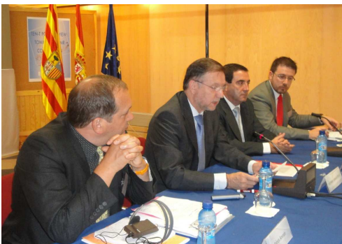
At the invitation of Luisa Fernanda Rudi, President of the Region of Aragon, the CPMR Inter-Commission TEN-T working group met in Zaragoza to study the proposals published on 19 October 2011 by the EC on the review of the Trans-European Transport Network and the Connecting Europe Facility (CEF) 9 November 2011, Zaragoza, Aragon (ES)

The improvement of the accessibility of peripheral maritime regions is among the medium-term strategic priorities of the CPMR. With this in mind, a decision was made to concentrate organisational efforts on two priority issues: revision of the Trans-European Transport Network (TEN-T) as a Community instrument channelling European financing earmarked for infrastructure, and the promotion of sustainable maritime transport.