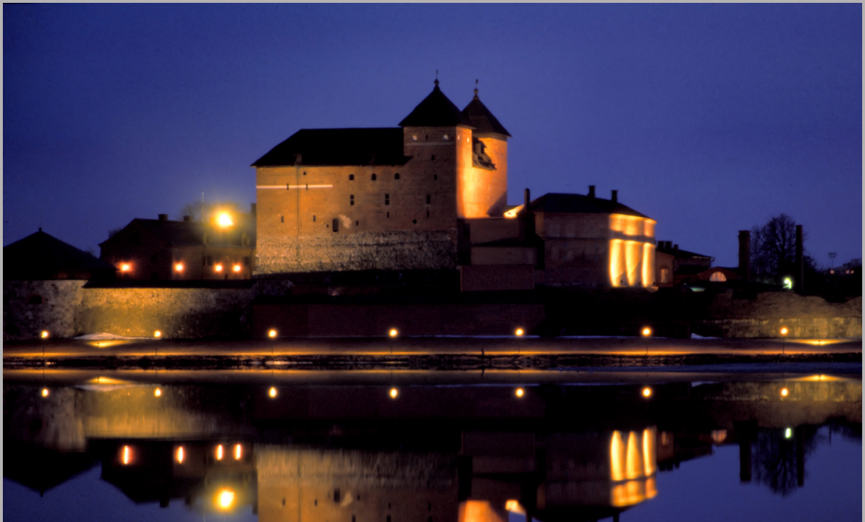
Häme Castle by night.

19.00-22.00 Dinner at the Medieval Castle of Häme