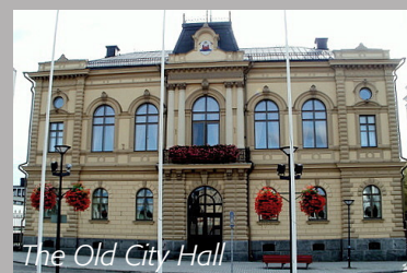
The Old City Hall