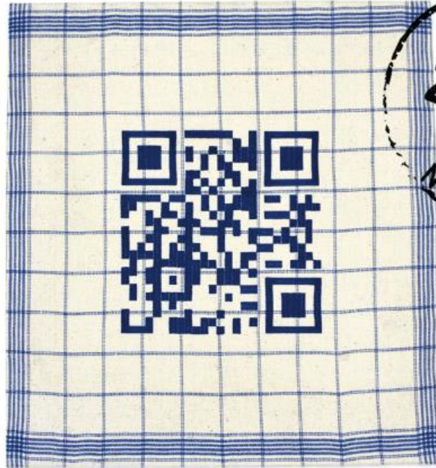
Anke Müffelmann language-patter-n d1 (Trautes Heim Glück allein) , 2015