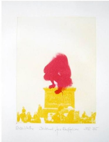
Esra Wille Internat für Tischlerlehre 2012 215