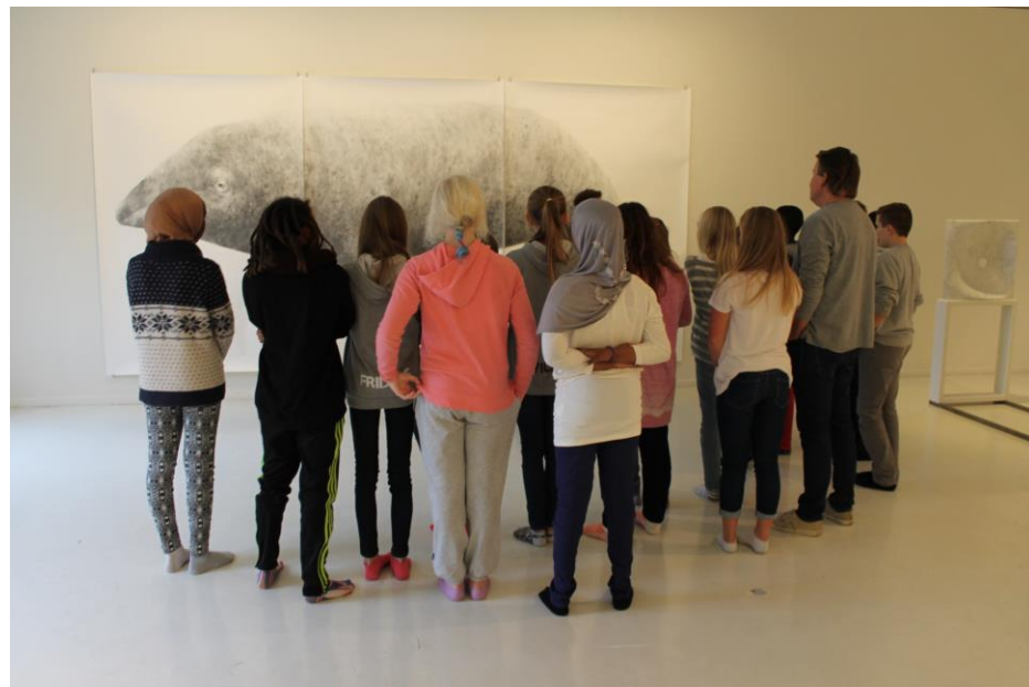
Østfold Kunstsenter - Omvisninger med 7. trinn I den lokale DKS