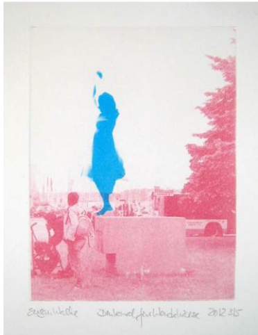
Esra Wille Internat für Tischlerlehre 2012 215