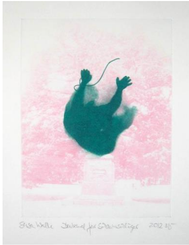
Esra Wille Internat für Steinmetzlinge 2012 215