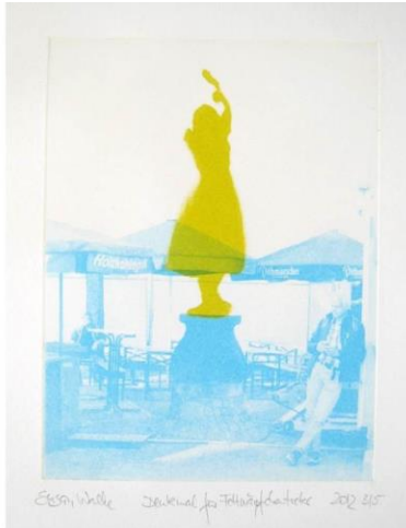
Esra Wille Internat für Tischlerlehre 2012 215