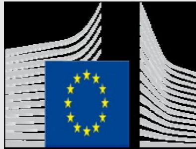
Creative Europe 2014-20